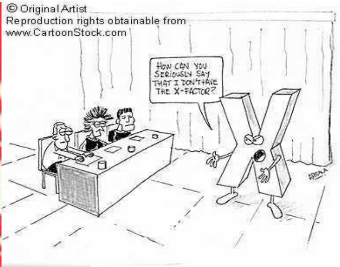
© Original Artist Reproduction rights obtainable from www.CartoonStock.com

The event is free for members and $ 8 for each non-member.